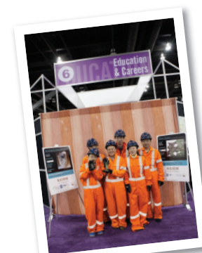
Students at the KGHM International photo booth, during M4S in conjunction with the CIM Conference in Vancouver, May 2014.