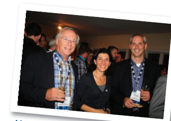
Macallan, Highland Park and Laphroaig Scotch Tasting in Sept-Îles